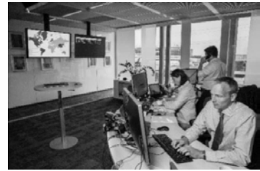
Medical and security assistance plateau.