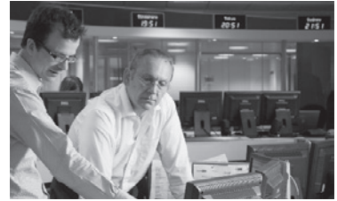
Information and training of collaborators sent abroad is highly important for their safety and the success of the mission.