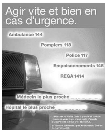
A professional mission abroad must comply to the same safety criteria as in Switzerland.