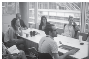
The internal security policy also concerns all actions and collaborators (and accompanying persons) when travelling outside of Switzerland.