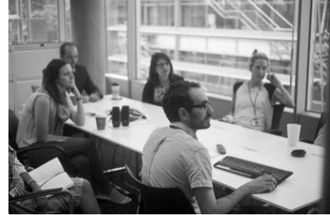
The internal security policy also concerns all actions and collaborators (and accompanying persons) when travelling outside of Switzerland.