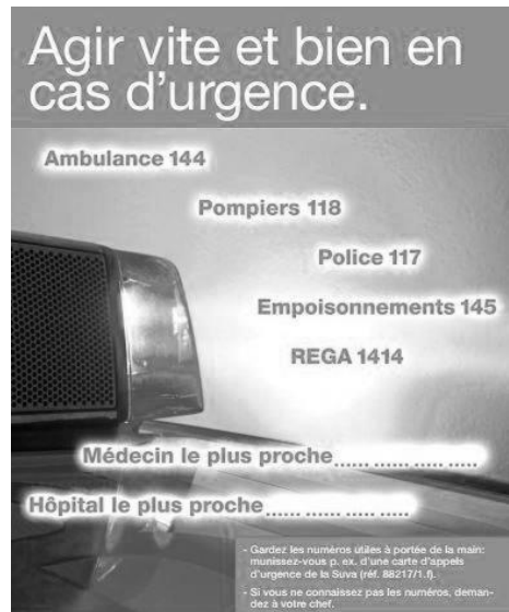
A professional mission abroad must comply to the same safety criteria as in Switzerland.