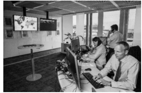
Medical and security assistance